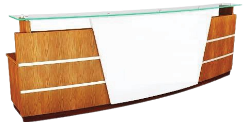
MODEL : SFH-RT-12-06