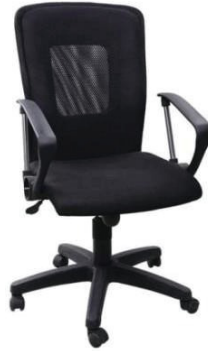
MODEL : SFH-OC-01-67