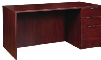
MODEL : SFH-EOT-02-39