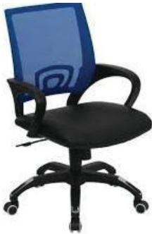
MODEL : SFH-OC-01-69