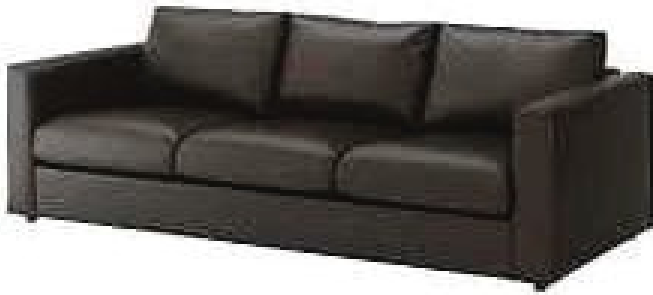
MODEL : SFH-WS-10-08