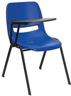
MODEL : SFH-CC-01-158