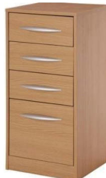
MODEL : SFH-MDU-03-08