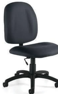
MODEL : SFH-OC-01-71