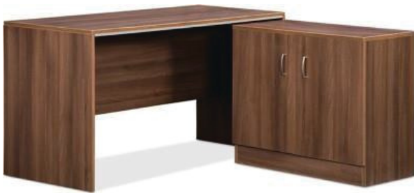
MODEL : SFH-EOT-02-107