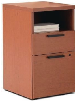
MODEL : SFH-MDU-03-17