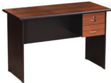
MODEL : SFH-EOT-02-11