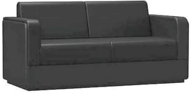
MODEL : SFH-WS-10-02