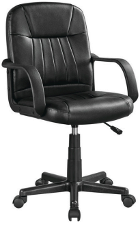
MODEL : SFH-OC-01-24