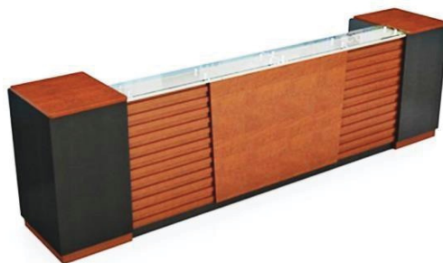
MODEL : SFH-RT-12-23