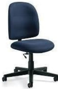
MODEL : SFH-OC-01-70