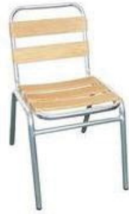
MODEL : SFH-VC-01-122