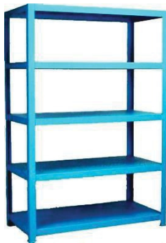
MODEL : SFH-SR-08-27