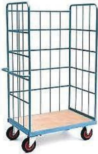
MODEL : SFH-CT-08-49