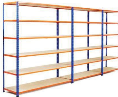
MODEL : SFH-SR-08-30