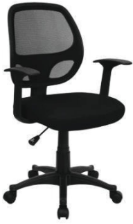
MODEL : SFH-OC-01-34