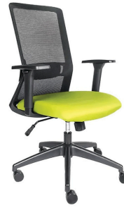
MODEL : SFH-OC-01-26