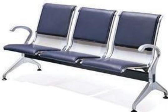
MODEL : SFH-STOOL-01-197