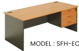
MODEL : SFH-EOT-02-18