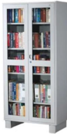
MODEL : SFH-SAL-08-02