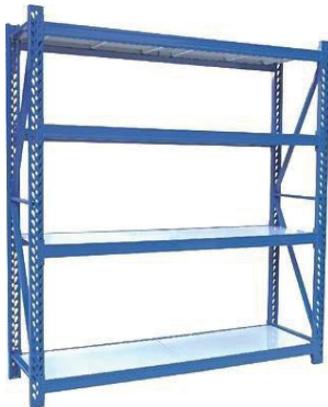
MODEL : SFH-SR-08-29