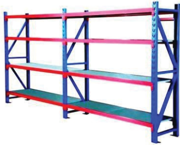
MODEL : SFH-SR-08-23