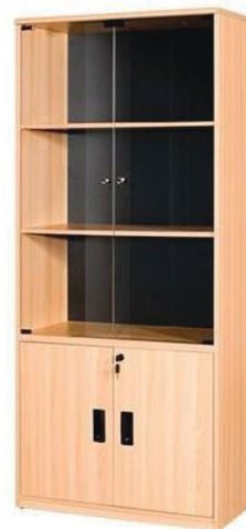
MODEL : SFH-OC-06-05