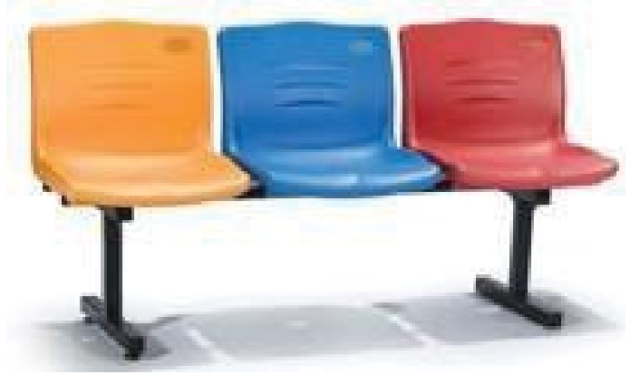
MODEL : SFH-STOOL-01-192