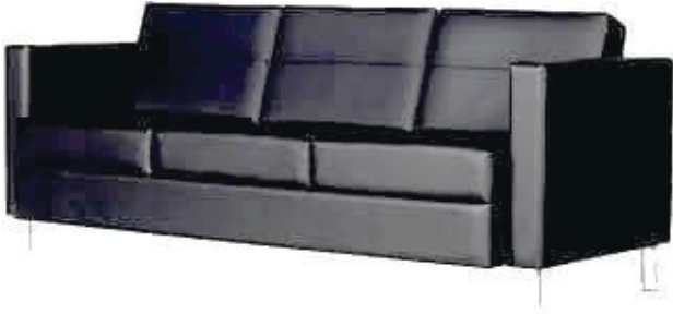
MODEL : SFH-WS-10-12