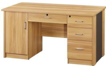
MODEL : SFH-EOT-02-14