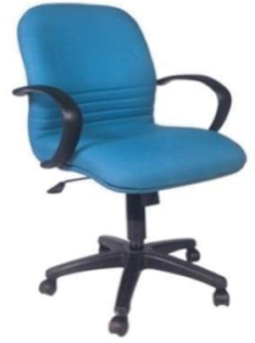
MODEL : SFH-OC-01-30