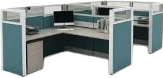
MODEL : SFH-WS-11-04