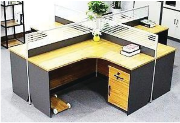
MODEL : SFH-WS-11-21