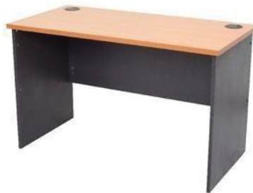
MODEL : SFH-EOT-02-08