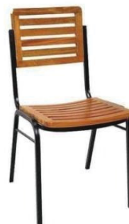
MODEL : SFH-VC-01-117