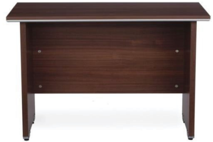
MODEL : SFH-EOT-02-13