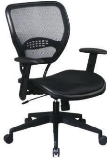
MODEL : SFH-OC-01-35