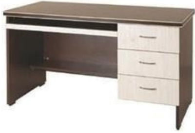
MODEL : SFH-EOT-02-03