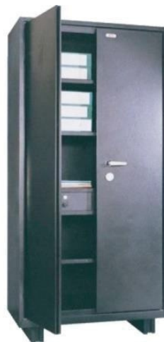
MODEL : SFH-SAL-08-12