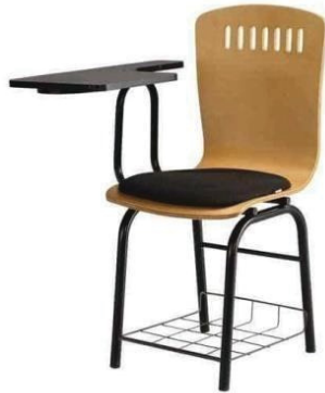
MODEL : SFH-CC-01-152