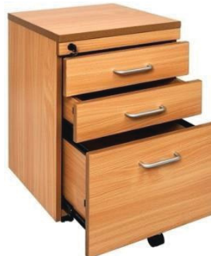
MODEL : SFH-MDU-03-18