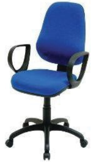
MODEL : SFH-OC-01-65