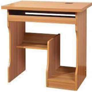
MODEL : SFH-CT-02-153