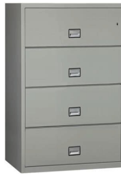
MODEL : SFH-SFC-07-13