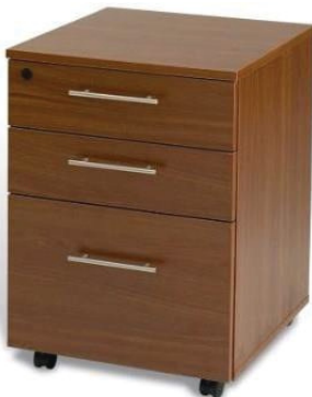
MODEL : SFH-MDU-03-07