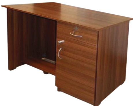
MODEL : SFH-EOT-02-43