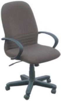
MODEL : SFH-OC-01-31