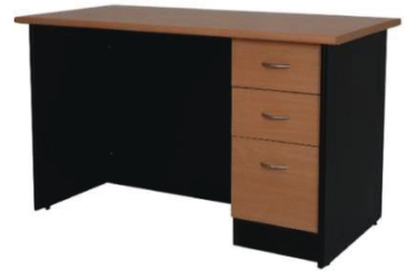
MODEL : SFH-EOT-02-23