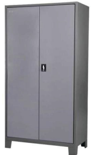
MODEL : SFH-SAL-08-09