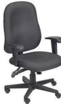
MODEL : SFH-OC-01-23