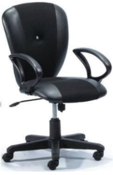
MODEL : SFH-OC-01-68