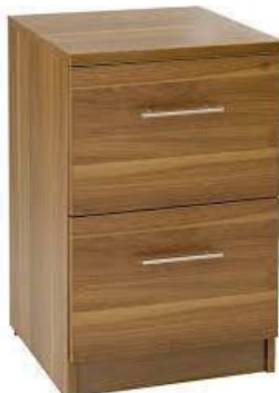
MODEL : SFH-MDU-03-06