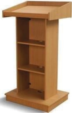
MODEL : SFH-RT-05-01