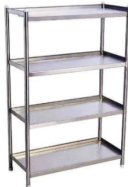
MODEL : SFH-SR-08-34