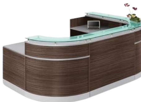
MODEL : SFH-RT-12-04