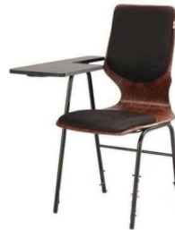
MODEL : SFH-CC-01-161