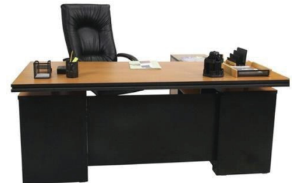
MODEL : SFH-EOT-02-103