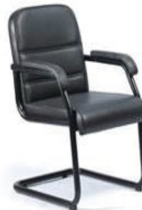
MODEL : SFH-VC-01-108