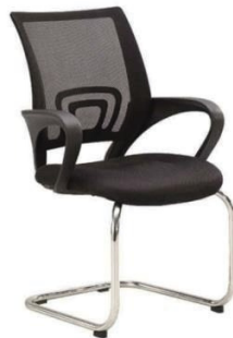
MODEL : SFH-VC-01-104