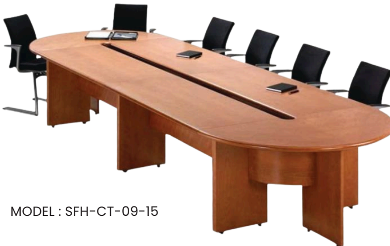
MODEL : SFH-CT-09-15