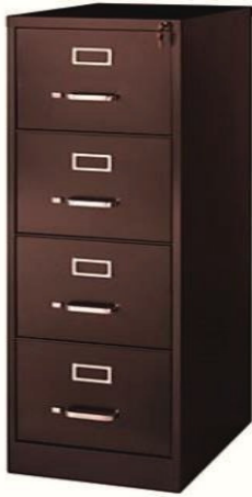
MODEL : SFH-SFC-07-01