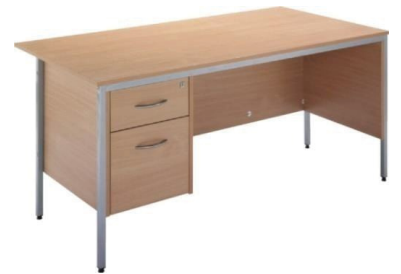
MODEL : SFH-EOT-02-42