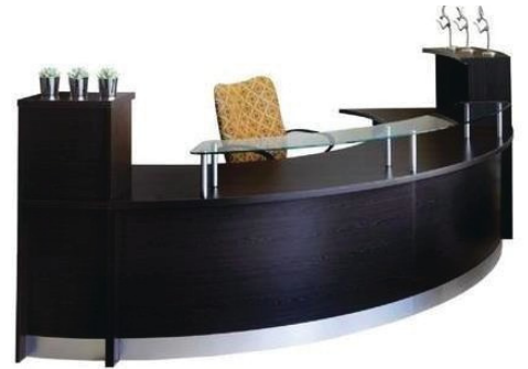
MODEL : SFH-RT-12-20