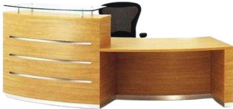
MODEL : SFH-RT-12-05