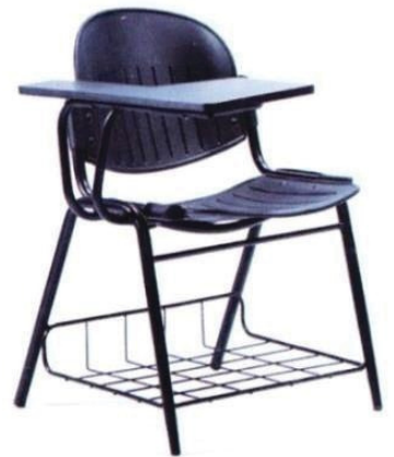
MODEL : SFH-CC-01-154