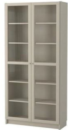
MODEL : SFH-SAL-08-06