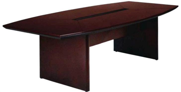
MODEL : SFH-CT-09-12