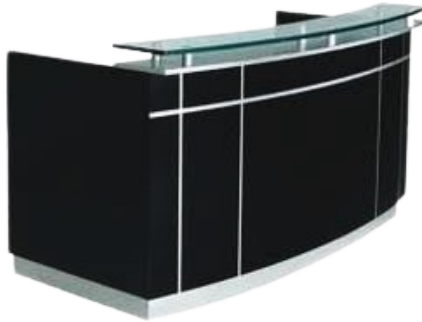
MODEL : SFH-RT-12-08