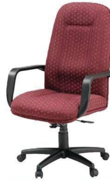
MODEL : SFH-OC-01-73