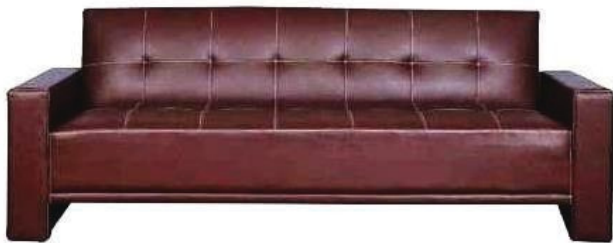
MODEL : SFH-WS-10-13