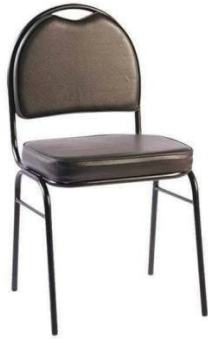
MODEL : SFH-VC-01-120