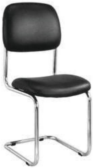
MODEL : SFH-VC-01-110