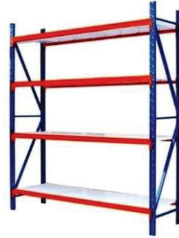
MODEL : SFH-SR-08-24