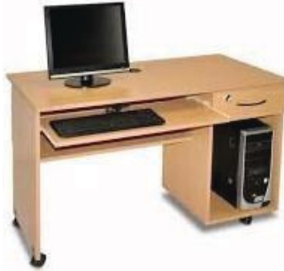
MODEL : SFH-CT-02-161