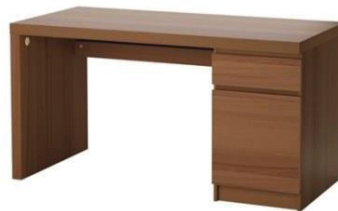
MODEL : SFH-EOT-02-22