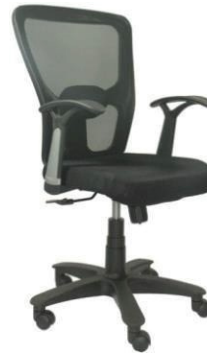
MODEL : SFH-OC-01-37