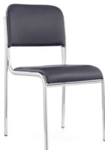
MODEL : SFH-VC-01-111