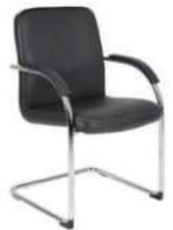
MODEL : SFH-VC-01-102