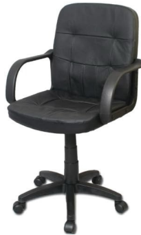
MODEL : SFH-OC-01-36