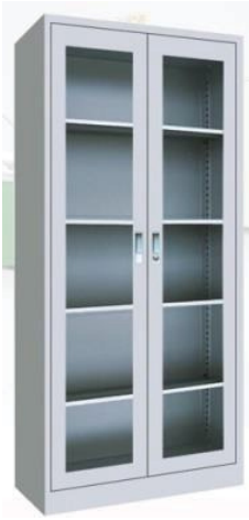
MODEL : SFH-SAL-08-01