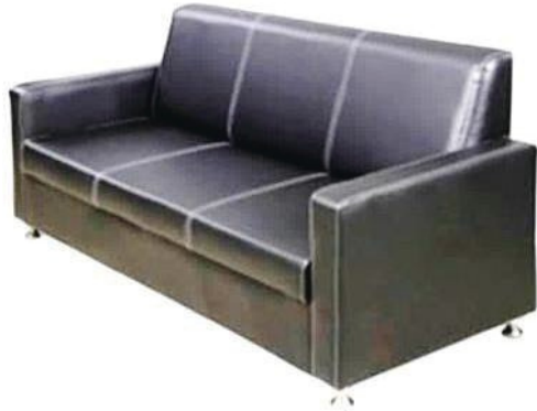
MODEL : SFH-WS-10-11