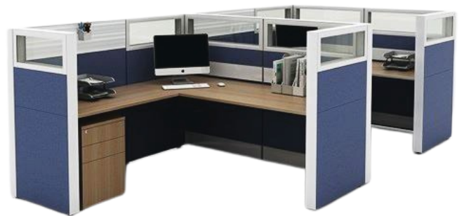
MODEL : SFH-WS-11-04