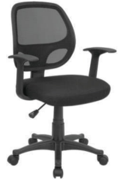
MODEL : SFH-OC-01-27