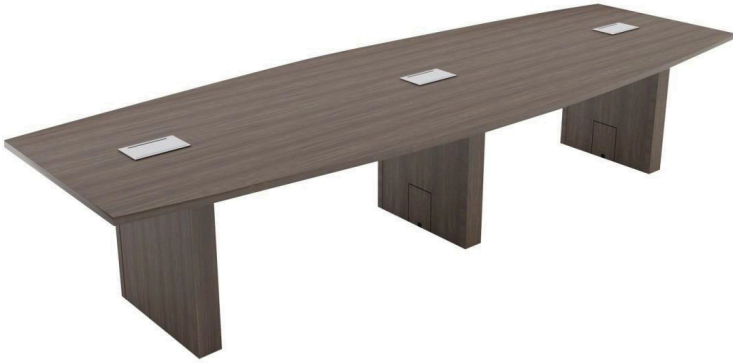
MODEL : SFH-CT-09-40