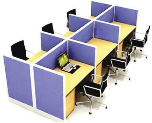
MODEL : SFH-WS-11-22