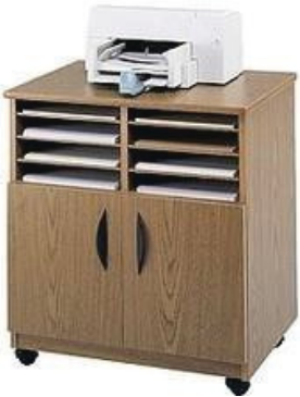
MODEL : SFH-PT-04-01