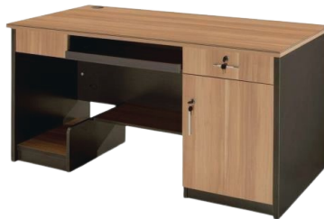
MODEL : SFH-EOT-02-10