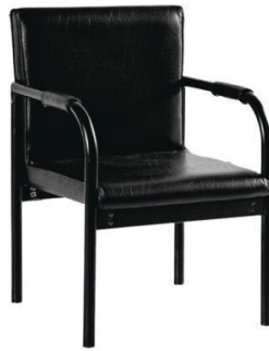
MODEL : SFH-VC-01-106