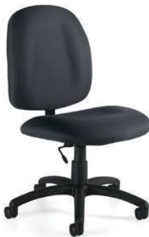
MODEL : SFH-OC-01-61