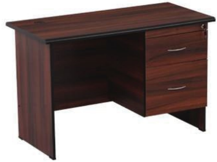
MODEL : SFH-EOT-02-06