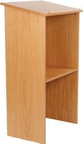
MODEL : SFH-RT-05-02