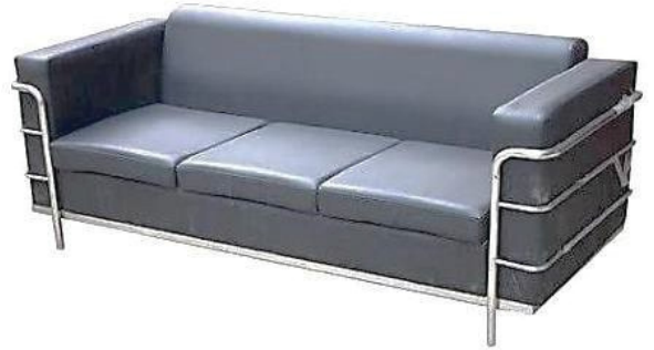
MODEL : SFH-WS-10-09