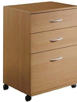
MODEL : SFH-MDU-03-03