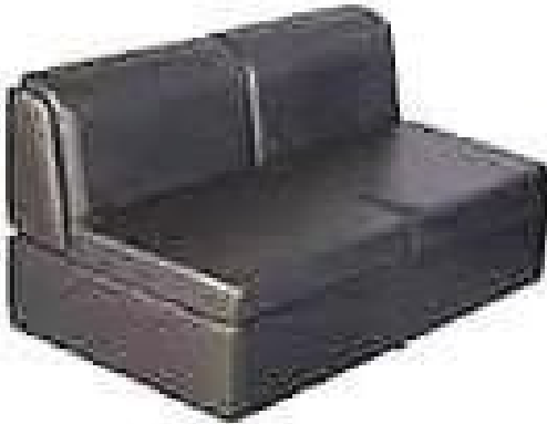
MODEL : SFH-WS-10-01