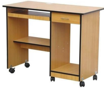
MODEL : SFH-CT-02-154