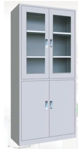
MODEL : SFH-SAL-08-04