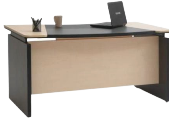
MODEL : SFH-EOT-02-20