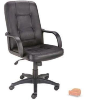
MODEL : SFH-OC-01-38