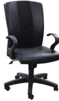
MODEL : SFH-OC-01-57