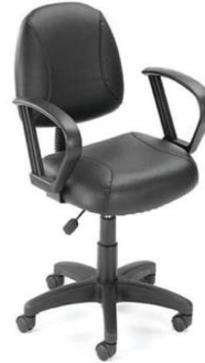
MODEL : SFH-OC-01-64