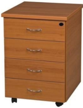
MODEL : SFH-MDU-03-05