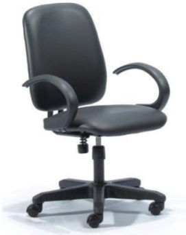
MODEL : SFH-OC-01-211