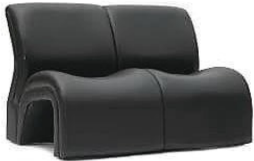
MODEL : SFH-WS-10-04