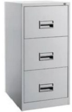
MODEL : SFH-SFC-07-06