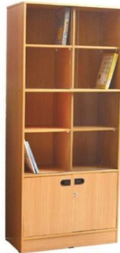
MODEL : SFH-OC-06-03