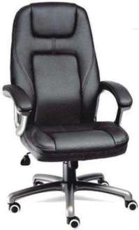
MODEL : SFH-OC-01-59