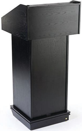
MODEL : SFH-RT-05-03