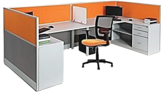
MODEL : SFH-WS-11-08