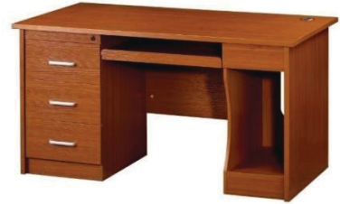
MODEL : SFH-CT-02-162