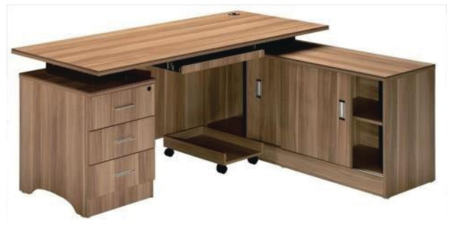
MODEL : SFH-EOT-02-108