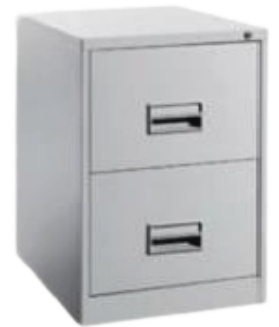
MODEL : SFH-SFC-07-05