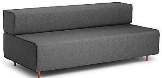
MODEL : SFH-WS-10-14