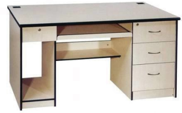
MODEL : SFH-CT-02-158