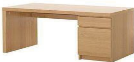
MODEL : SFH-EOT-02-16