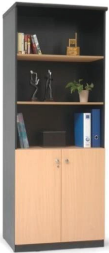
MODEL : SFH-OC-06-01