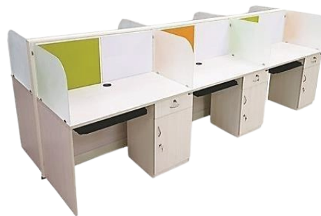
MODEL : SFH-WS-11-17