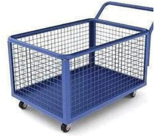
MODEL : SFH-CT-08-56