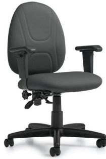
MODEL : SFH-OC-01-25