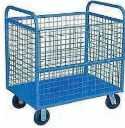
MODEL : SFH-CT-08-55