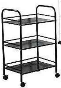
MODEL : SFH-CT-08-52