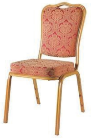
MODEL : SFH-CC-01-176