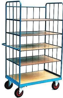
MODEL : SFH-CT-08-47