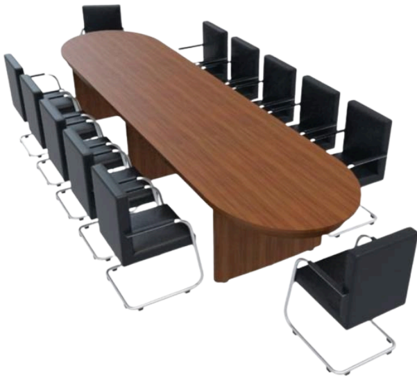
MODEL : SFH-CT-09-14