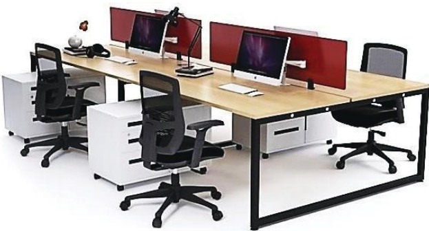
MODEL : SFH-WS-11-13