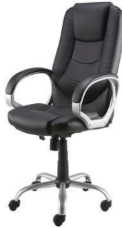
MODEL : SFH-OC-01-63