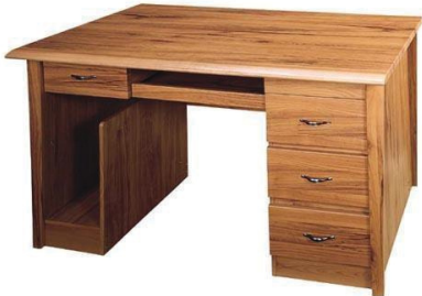
MODEL : SFH-EOT-02-24