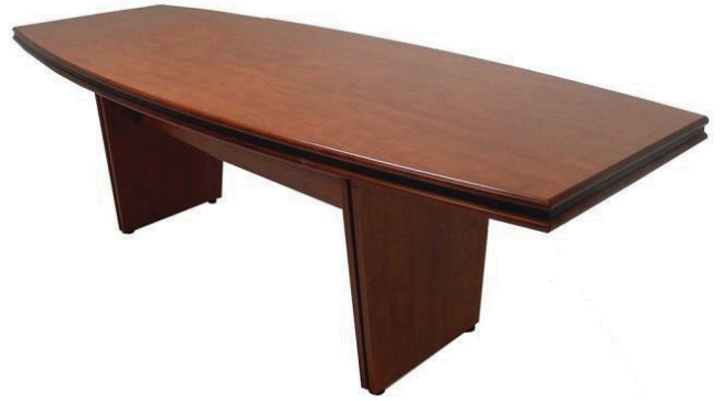
MODEL : SFH-CT-09-41