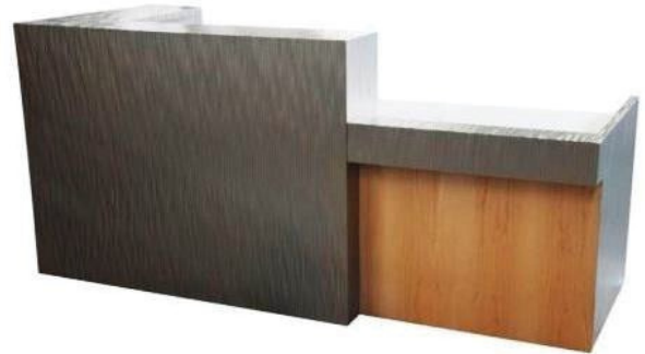
MODEL : SFH-RT-12-24