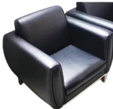
MODEL : SFH-WS-10-07