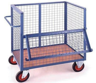
MODEL : SFH-CT-08-54