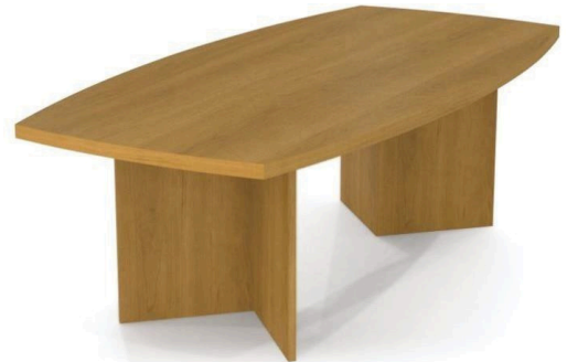
MODEL : SFH-CT-09-03