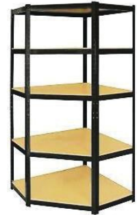
MODEL : SFH-SR-08-31