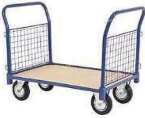
MODEL : SFH-CT-08-51