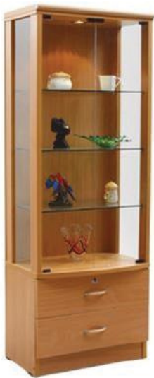
MODEL : SFH-OC-06-08