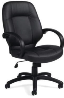
MODEL : SFH-OC-01-72