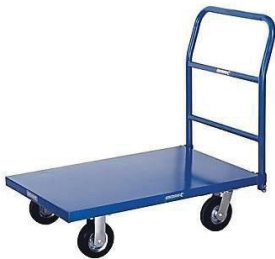
MODEL : SFH-CT-08-57