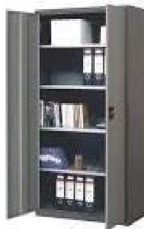
MODEL : SFH-SAL-08-13