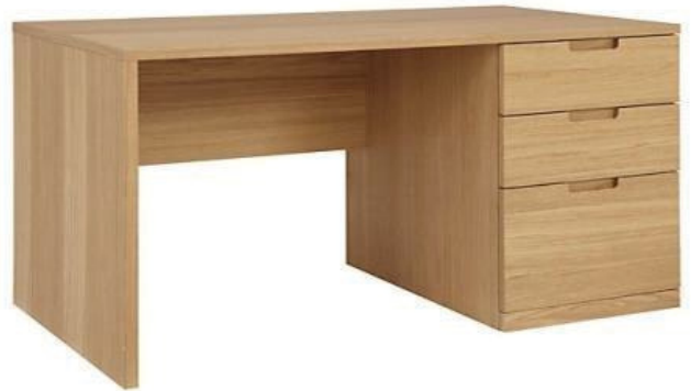
MODEL : SFH-EOT-02-51