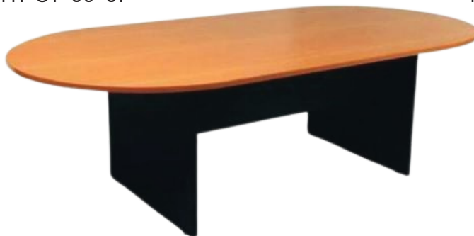
MODEL : SFH-CT-09-04