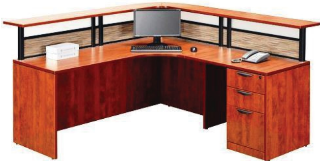
MODEL : SFH-RT-12-15