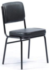
MODEL : SFH-VC-01-116