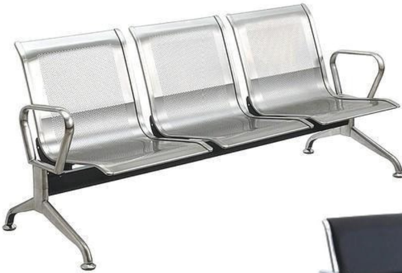
MODEL : SFH-STOOL-01-195