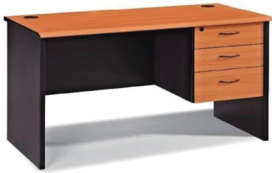
MODEL : SFH-EOT-02-15