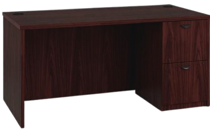
MODEL : SFH-EOT-02-38