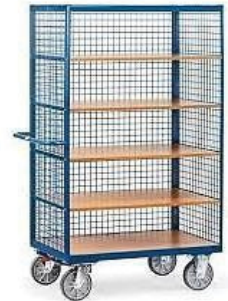
MODEL : SFH-CT-08-48