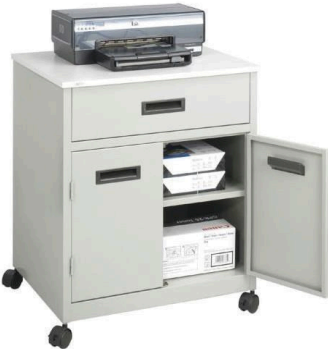
MODEL : SFH-PT-04-02