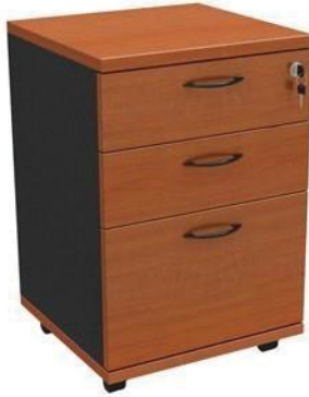
MODEL : SFH-MDU-03-14