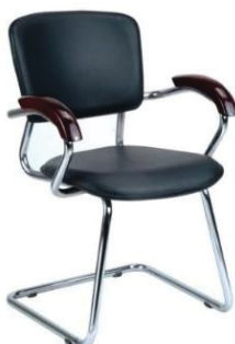
MODEL : SFH-VC-01-109