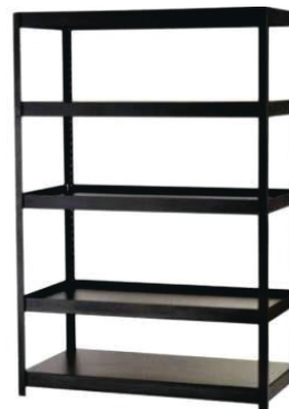
MODEL : SFH-SR-08-26