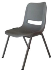
MODEL : SFH-CC-01-175