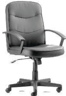
MODEL : SFH-OC-01-29