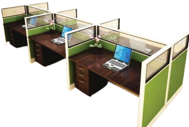
MODEL : SFH-WS-11-03