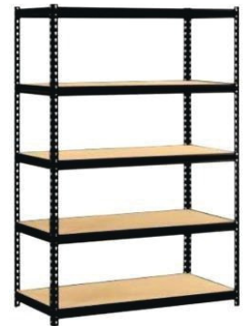
MODEL : SFH-SR-08-25