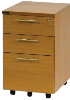
MODEL : SFH-MDU-03-09