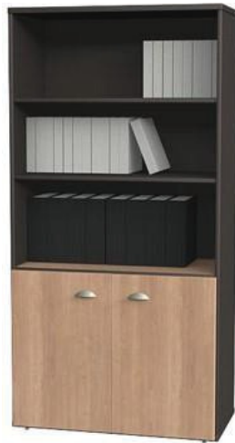
MODEL : SFH-OC-06-02