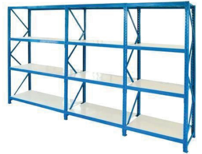
MODEL : SFH-SR-08-28