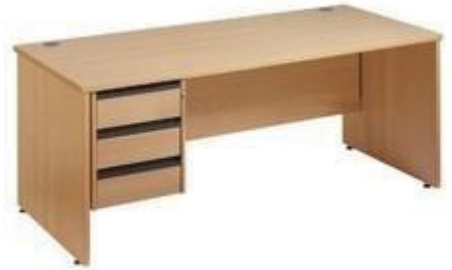
MODEL : SFH-EOT-02-46