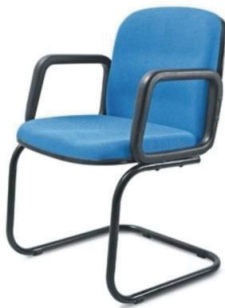
MODEL : SFH-VC-01-103