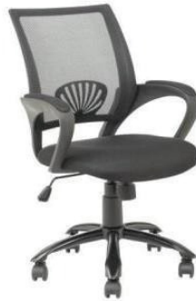
MODEL : SFH-OC-01-22