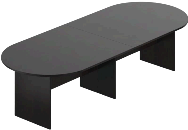
MODEL : SFH-CT-09-42