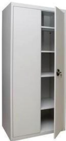
MODEL : SFH-SAL-08-11