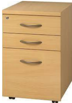
MODEL : SFH-MDU-03-02