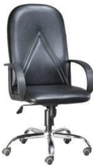
MODEL : SFH-OC-01-62