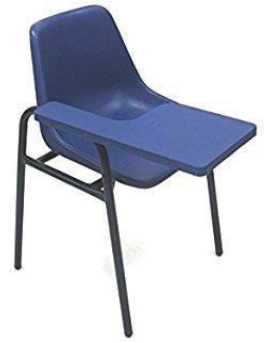
MODEL : SFH-CC-01-157