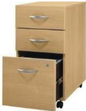
MODEL : SFH-MDU-03-16