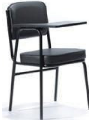
MODEL : SFH-CC-01-153