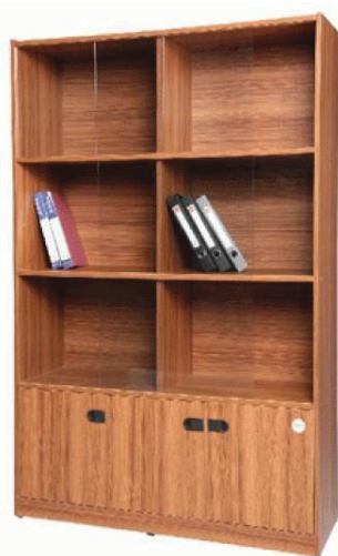
MODEL : SFH-OC-06-11