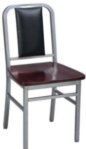
MODEL : SFH-CC-01-174