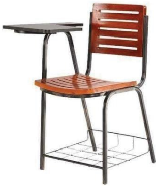
MODEL : SFH-CC-01-151