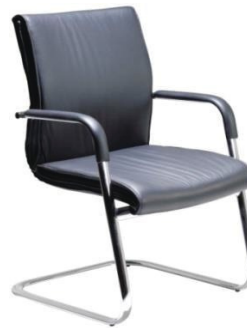
MODEL : SFH-VC-01-107