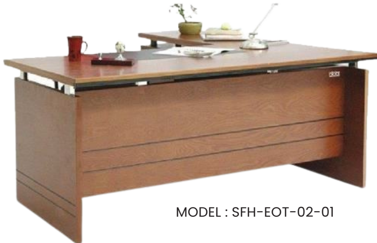
MODEL : SFH-EOT-02-01