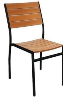
MODEL : SFH-VC-01-115