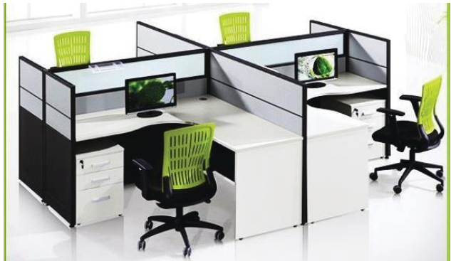
MODEL : SFH-WS-11-14