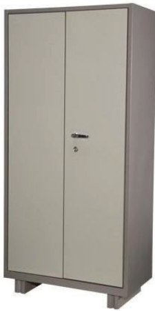
MODEL : SFH-SAL-08-08