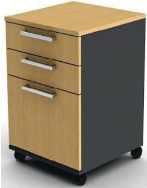
MODEL : SFH-MDU-03-11