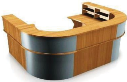
MODEL : SFH-RT-12-01