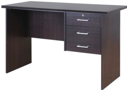
MODEL : SFH-EOT-02-07