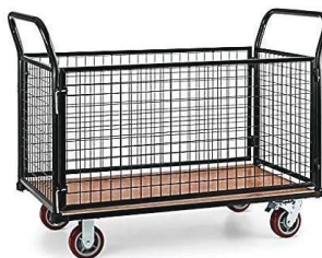
MODEL : SFH-CT-08-53