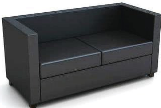
MODEL : SFH-WS-10-03