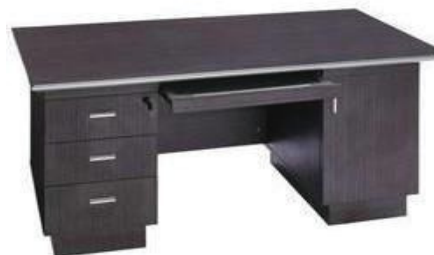
MODEL : SFH-EOT-02-19