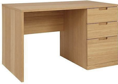
MODEL : SFH-EOT-02-09