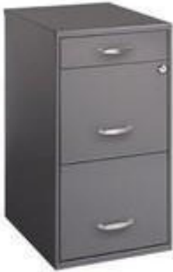
MODEL : SFH-SFC-07-08