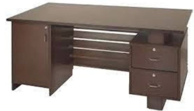
MODEL : SFH-EOT-02-17