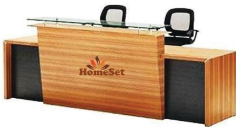
MODEL : SFH-RT-12-19