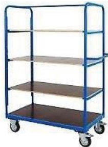
MODEL : SFH-CT-08-50