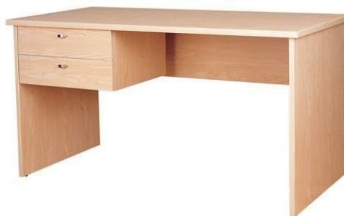
MODEL : SFH-EOT-02-47