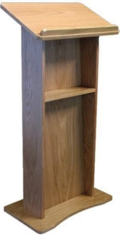
MODEL : SFH-RT-05-04