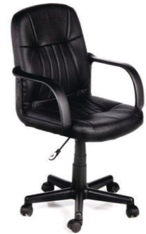
MODEL : SFH-OC-01-60