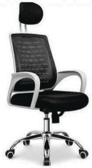
MODEL : SFH-OC-01-58