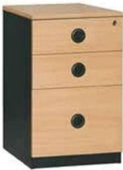
MODEL : SFH-MDU-03-01