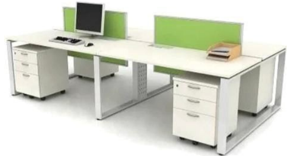
MODEL : SFH-WS-11-12