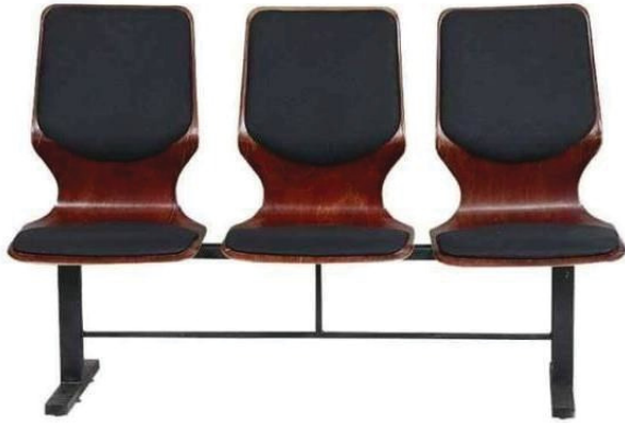
MODEL : SFH-STOOL-01-191