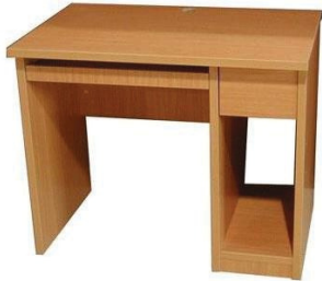
MODEL : SFH-CT-02-157