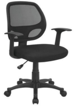
MODEL : SFH-OC-01-74