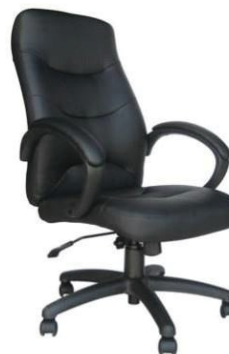
MODEL : SFH-OC-01-66