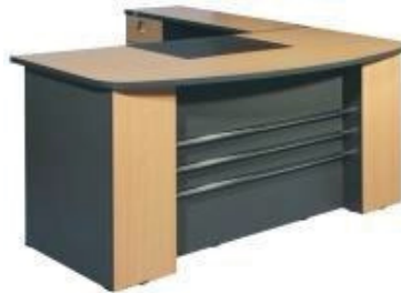
MODEL : SFH-EOT-02-104