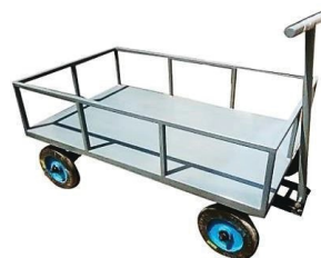
MODEL : SFH-CT-08-58