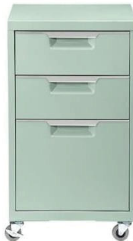
MODEL : SFH-SFC-07-14