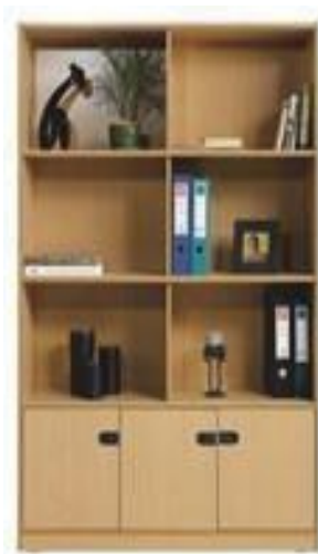
MODEL : SFH-OC-06-12