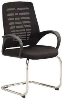
MODEL : SFH-VC-01-101