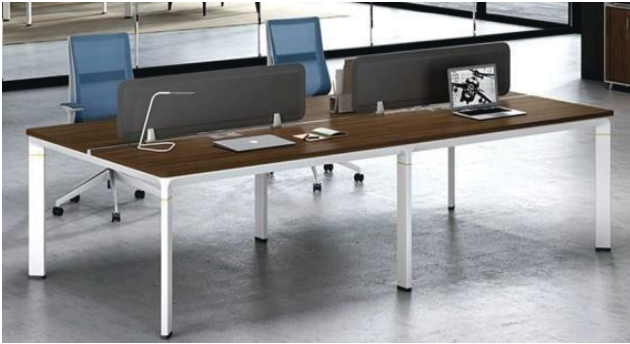
MODEL : SFH-WS-11-11