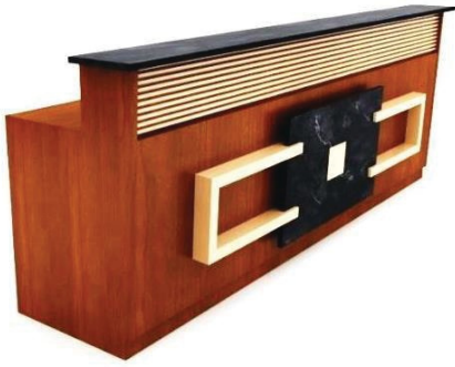
MODEL : SFH-RT-12-03