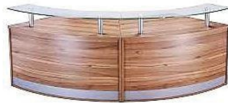
MODEL : SFH-RT-12-09