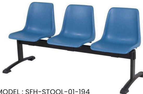
MODEL : SFH-STOOL-01-194