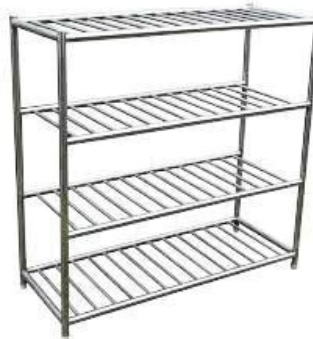
MODEL : SFH-SR-08-32