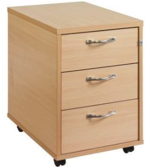
MODEL : SFH-MDU-03-12