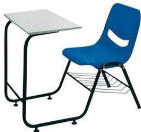
MODEL : SFH-CC-01-160