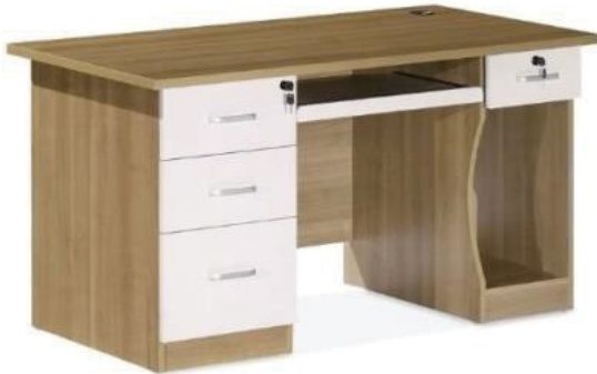
MODEL : SFH-EOT-02-50