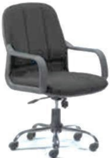
MODEL : SFH-OC-01-28