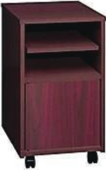
MODEL : SFH-PT-04-05