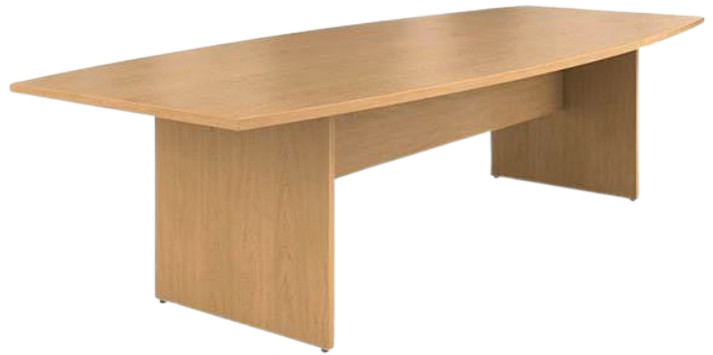
MODEL : SFH-CT-09-13