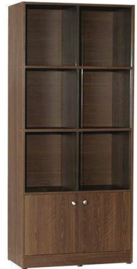
MODEL : SFH-OC-06-10