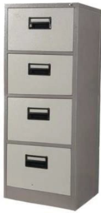
MODEL : SFH-SFC-07-02