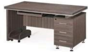
MODEL : SFH-EOT-02-21