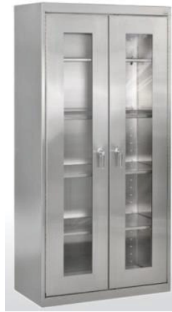
MODEL : SFH-SAL-08-03