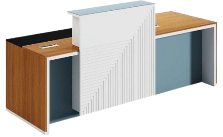
MODEL : SFH-RT-12-16