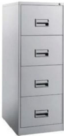
MODEL : SFH-SFC-07-07