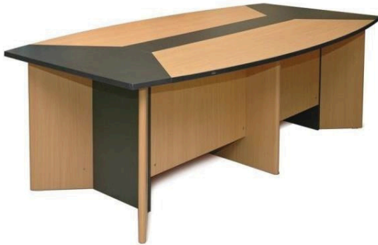
MODEL : SFH-CT-09-01