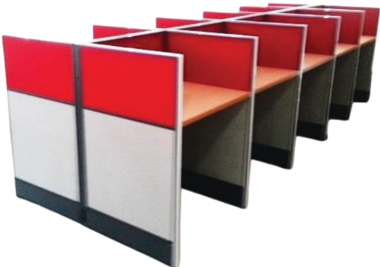
MODEL : SFH-WS-11-18