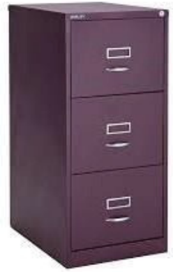
MODEL : SFH-SFC-07-10