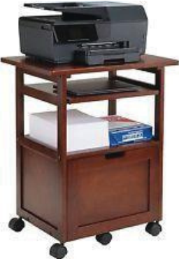
MODEL : SFH-PT-04-04