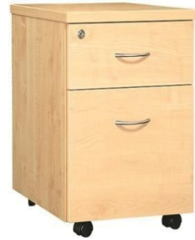
MODEL : SFH-MDU-03-04