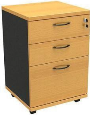
MODEL : SFH-MDU-03-13