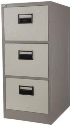
MODEL : SFH-SFC-07-12