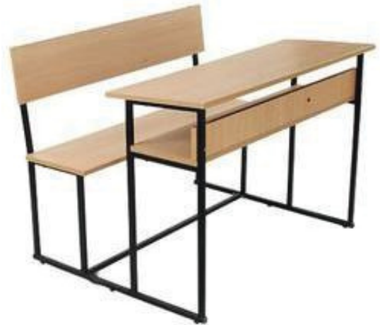
MODEL : SFH-CC-01-159