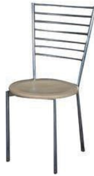
MODEL : SFH-VC-01-121