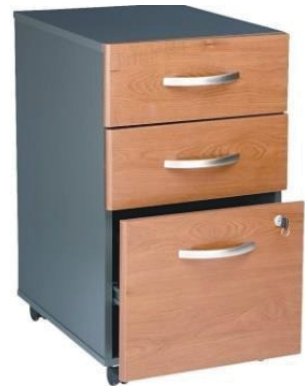
MODEL : SFH-MDU-03-10