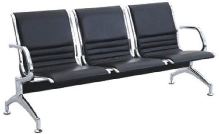
MODEL : SFH-STOOL-01-198