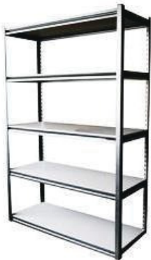
MODEL : SFH-SR-08-33