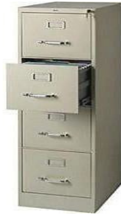
MODEL : SFH-SFC-07-03