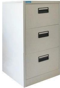
MODEL : SFH-SFC-07-09