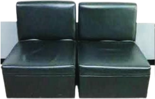
MODEL : SFH-WS-10-06