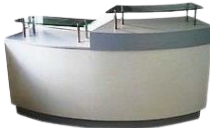
MODEL : SFH-RT-12-12