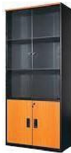
MODEL : SFH-OC-06-04