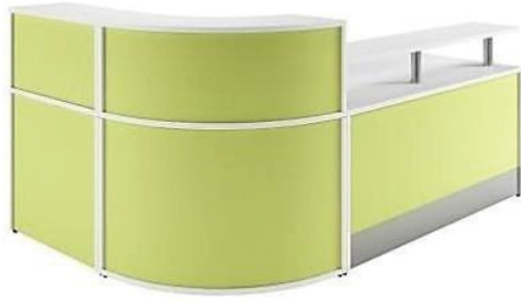
MODEL : SFH-RT-12-11