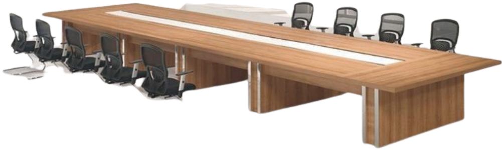
MODEL : SFH-CT-09-43