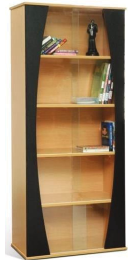
MODEL : SFH-OC-06-06