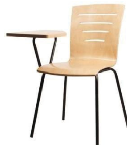
MODEL : SFH-CC-01-162