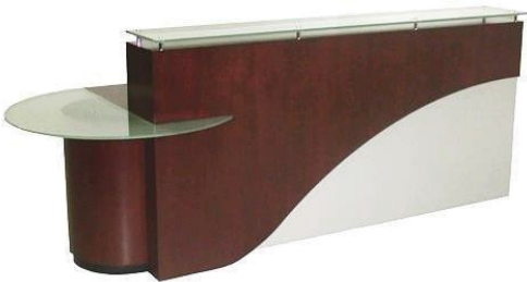
MODEL : SFH-RT-12-07