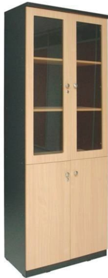
MODEL : SFH-OC-06-09