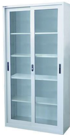
MODEL : SFH-SAL-08-05