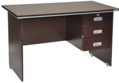
MODEL : SFH-EOT-02-02