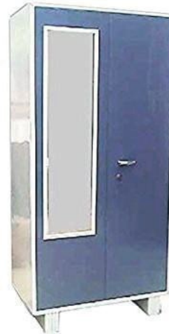
MODEL : SFH-SAL-08-10