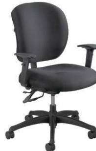
MODEL : SFH-OC-01-33