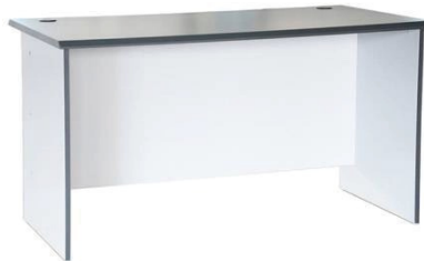
MODEL : SFH-EOT-02-14