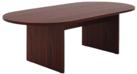
MODEL : SFH-CT-09-06