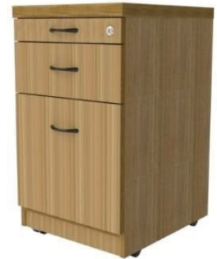
MODEL : SFH-MDU-03-15