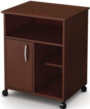
MODEL : SFH-PT-04-03