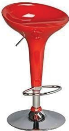
MODEL : SFH-STOOL-01-173