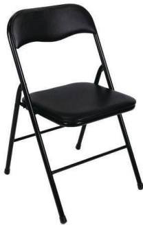
MODEL : SFH-VC-01-114