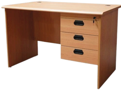
MODEL : SFH-EOT-02-04